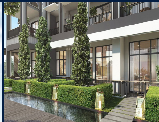
3 - Bedroom

TYPE C1 94 SQM / 1012 SQFT Buk 14 #0501 TO #0501